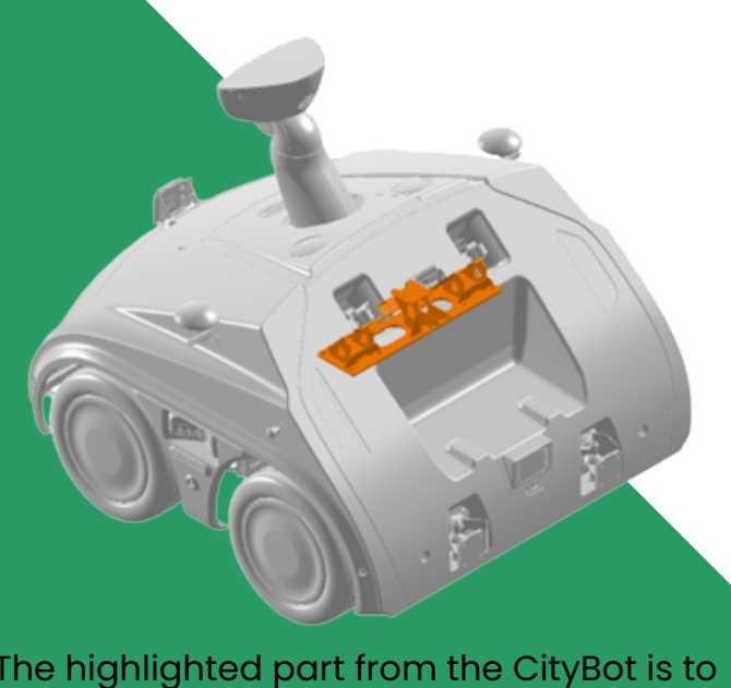
The highlighted part from the CityBot is to be replaced by a new aluminium alloy